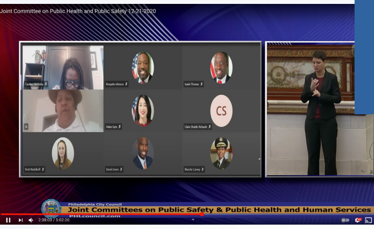
Di, a PBF client, testified before the Philadelphia City Council on the need to release people incarcerated during the Covid-19 Pandemic.

In the first months of the COVID-19 pandemic, we engaged in strategic research, which revealed a pattern of high bails being set behind closed doors. We also posted weekly breakdowns of bail in the city, so the public could access this key information.