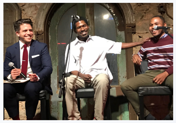
Searchlight Series at Eastern State Penitentiary.