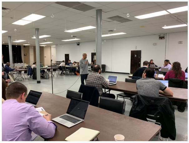
Expungment Clinic at St. Martin De Porres.