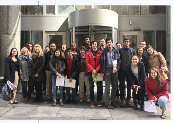
Swarthmore College court watchers in 2018.

Thanks to our victory in federal court, all bail hearings in Philadelphia must now be on record.